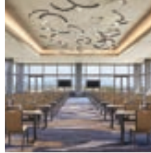
Marina del Rey Marriott