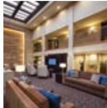
Hilton Garden Inn