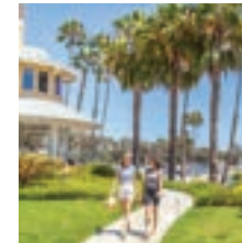
Jamaica Bay Inn