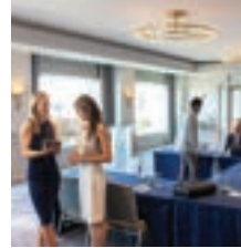
The Ritz-Carlton, Marina del Rey