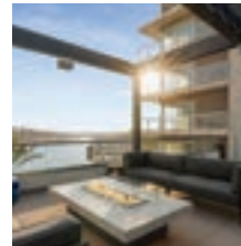
Residence Inn by Marriott