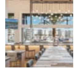
Courtyard by Marriott